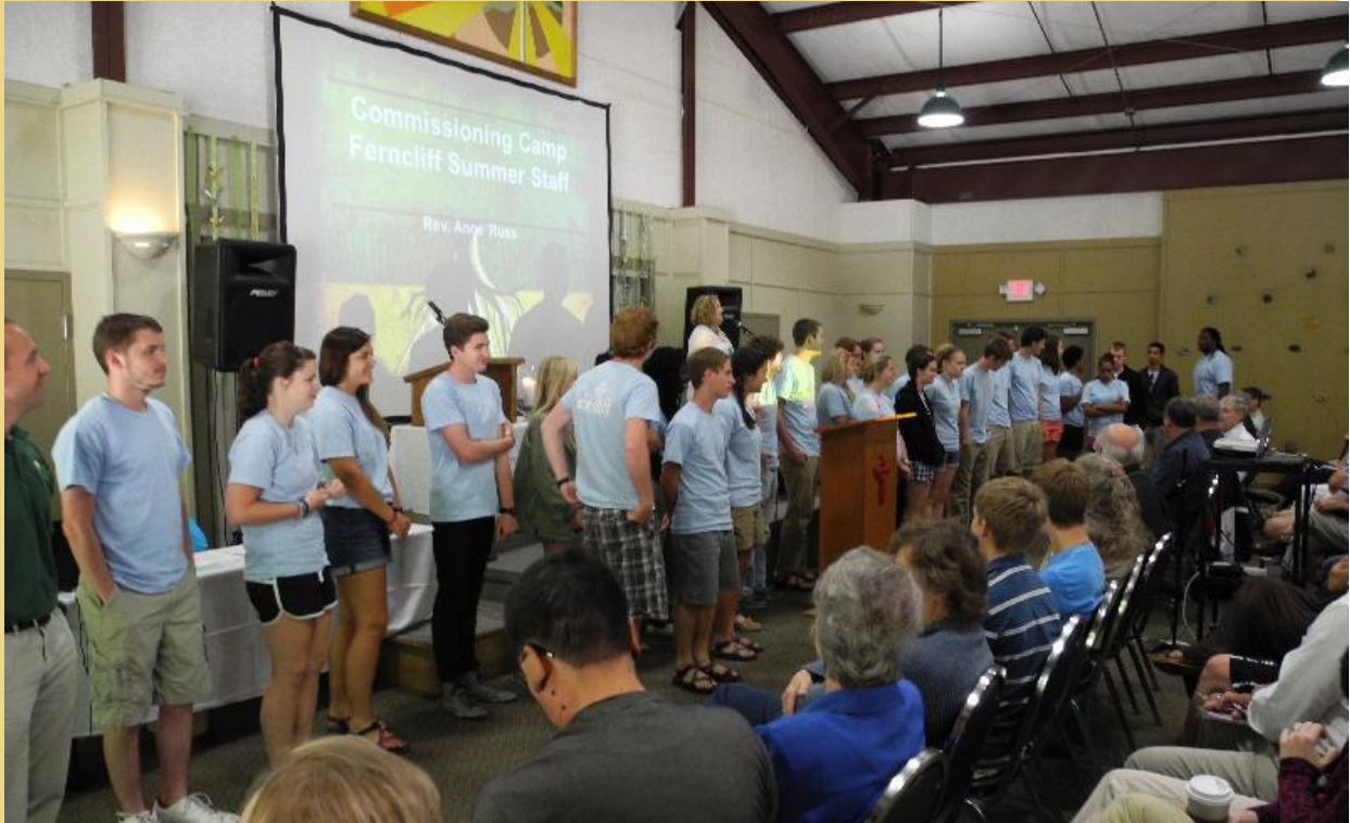
Ferncliff's summer camp counselors who were commissioned at presbytery meeting