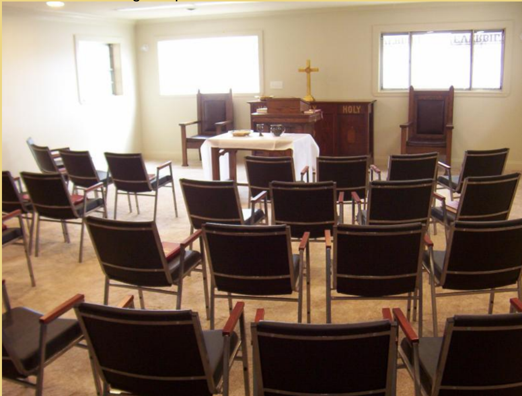
Westminster's new worship space

Sunday. The building was made handicapped accessible. The kitchen was improved with all new appliances. Thanks to the people of First Presbyterian Church, Madison, Kansas (a congregation that was closing) chancel furnishings, pulpit, piano, and other items were donated. Thanks to Presbyterian Disaster Assistance and to the generosity of several congregations in four different states, support was given to the church as we moved to a new neighborhood and began reaching out to the people in south Pulaski County. New siding and a new parking lot, along with a new sign, are in the works and nearing completion.