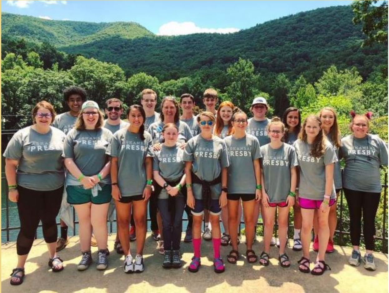
Presbytery of Arkansas' Montreat Youth Conference attendees