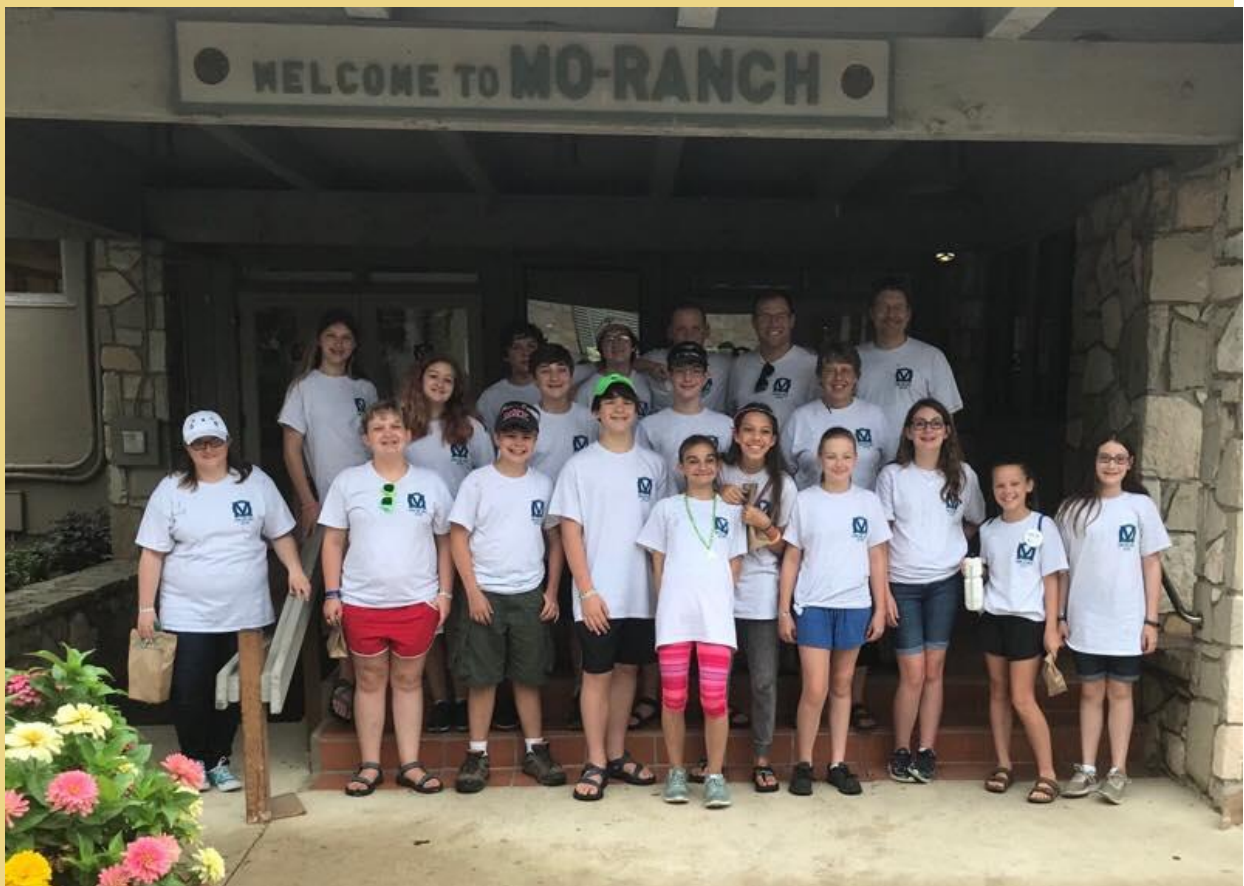
Presbytery of Arkansas' Mo-Ranch Junior High Jubilee attendees

Presbytery organized and sponsored groups of youth and adults from our congregations to Mo-Ranch Junior High Jubilee (June 30-July 5) in Texas and Montreat Youth Conference (July 21-28) in North Carolina