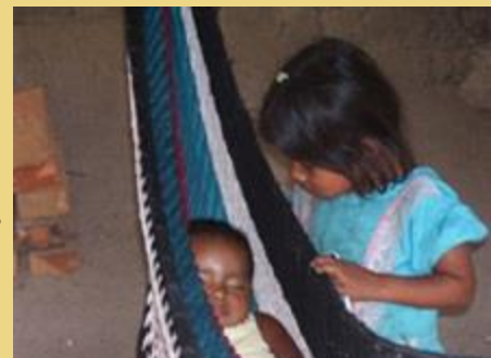
Making New Friends