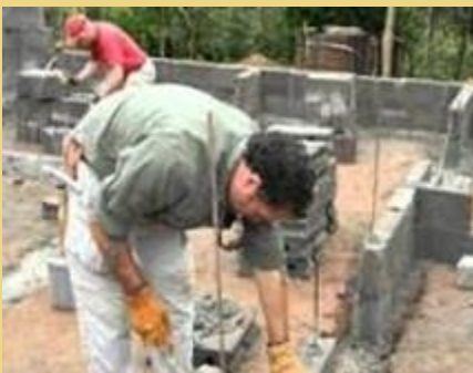
Learning New Skills