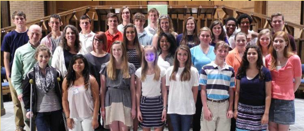
Triennium delegates from the Presbytery of Arkansas and from Second Presbyterian, Little Rock were commissioned at presbytery meeting