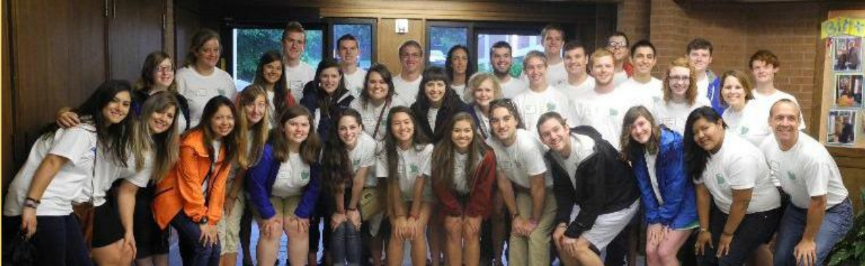
Ferncliff camp counselors commissioned at presbytery meeting